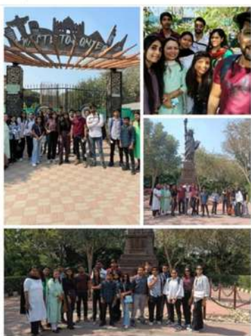
The Department of Management organised an EVS field trip to Waste to Wonder Theme Park, Sarai Kale Khan on 14/03/2023 for BBA students.