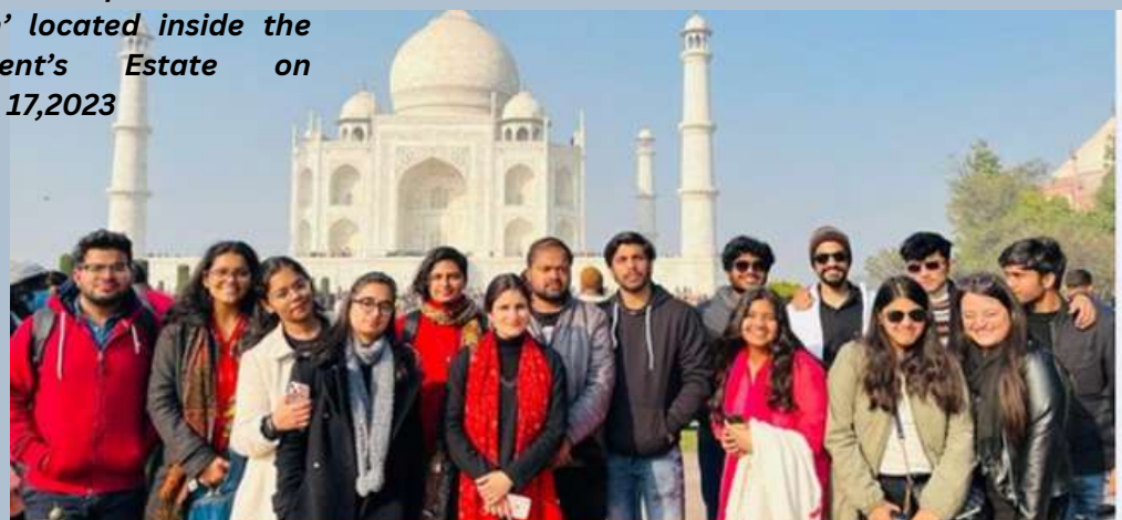
Trinity Institute of Innovations in Professional Studies organised a one day visit to Agra- Taj Mahal for Photo Walk which was held on 7th January, 2023.