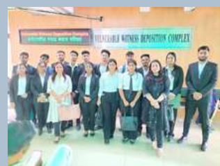
Students of BALLB VISIT TO KARKARDOOMA DISTRICT COURT, DELHI ON 17TH APRIL 2023.