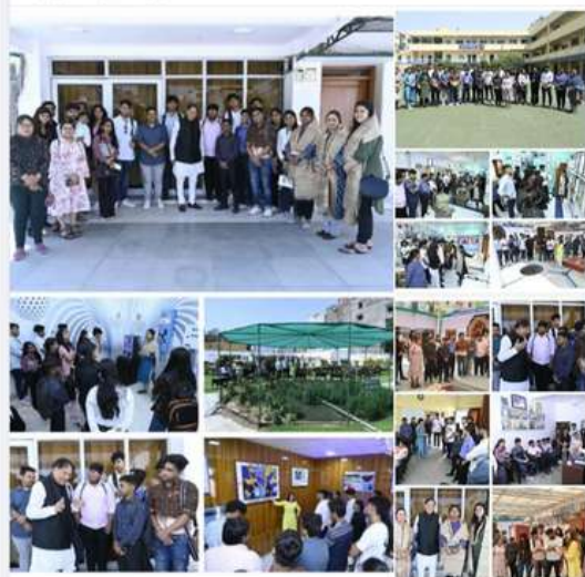
The Management Department of TIIPS, GN organised a EVS field visit to the Sulabh International Museum of Toilets on 8th April 2023 for BBA students.