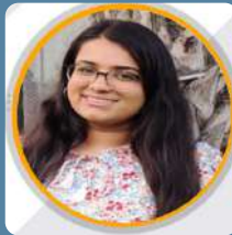
Bhawyata 83.16% 6th Semester