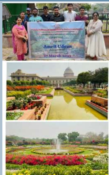
The BCA Department TIIPS, Greater Noida organized an excursion Trip to ' Amrit Udyan' located inside the President's Estate on March 17,2023