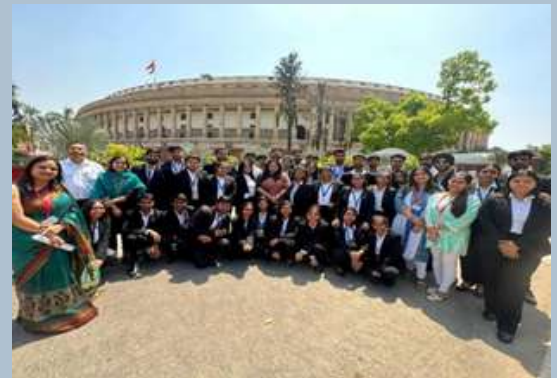
Students of BA LLB got the opportunity to explore places of significance to our democratic nation, including the Rajya Sabha and Lok Sabha. It was a great exposure for all the students.