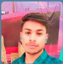
Achal 81.12% 2nd Semester