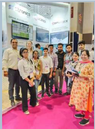
The Computer Science & Engineering Department (B. Tech & BCA) organised an Industrial Visit to Pragati Maidan New Delhi that was based on Convergence India & Smart Cities India Expo 2023 on 28th March 2023.